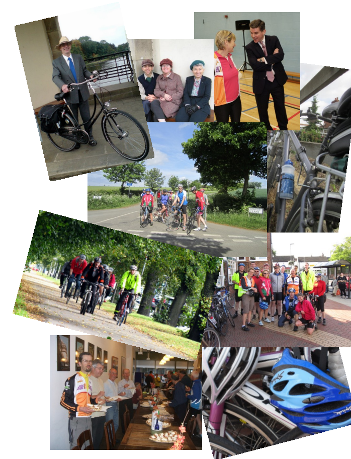
City ride in period dress Meeting the Minister for Sport Road ride hosted by Beeston CC New ride leaders on a training course Kick-off event

By the beginning of September we had smashed our targets in terms of participant numbers and new leaders. Over 1,000 riders will have participated this year and there are 15 new trained leaders ready to deliver rides! We have started to offer themed rides including history tours, period dress and full on road rides. Strong and effective working relationships have been established with new partners such as Sustrans, Borough Councils and local cycling clubs. Our launch event for existing leaders will be followed up by a larger celebration event in December where we seek to honour all our volunteers!