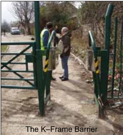
The K-Frame Barrier

former railway under the M1 between Watnall and Low Wood Road (Nuthall/Hempshill Vale) where some local residents were bitterly opposed to allowing cyclists to use this path because of fears about increased motor bike abuse on nearby land.